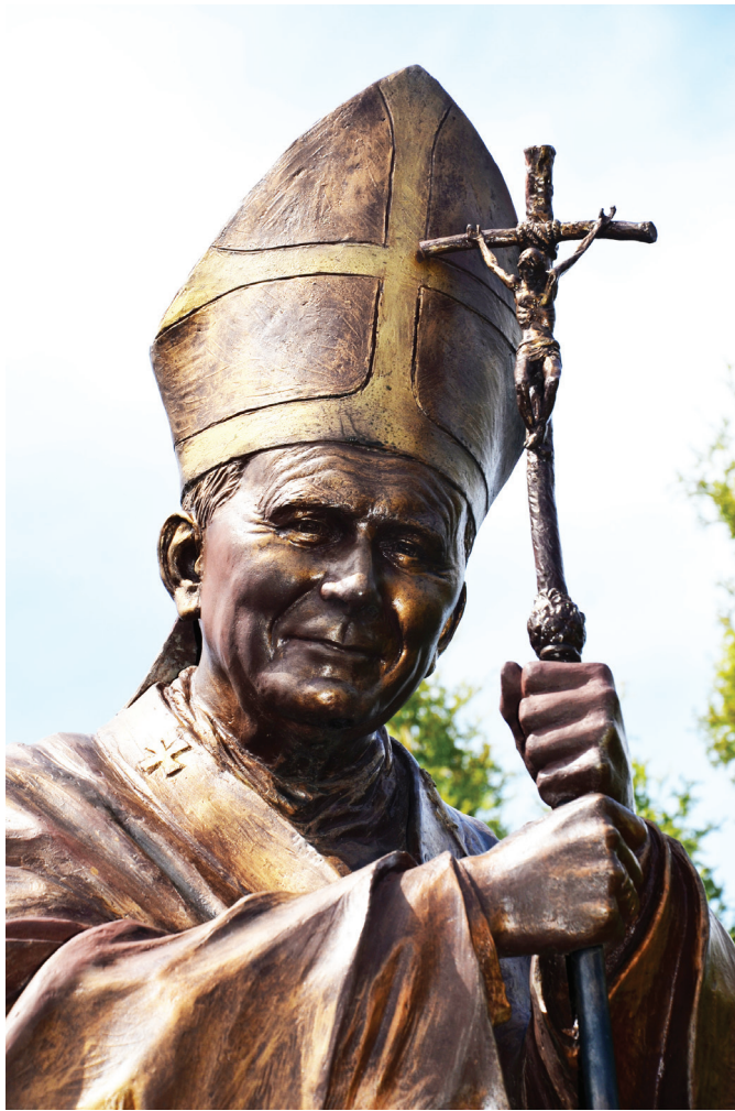
Statue of Saint Jean Paul II at the Shrine of the Ecce Homo. This pope canonized Saint Mary Faustina in Rome on April 30, 2000

a heroin, always wearing a smile for everyone, for she “wanted to be a Host offered to serve the Church and the souls.”